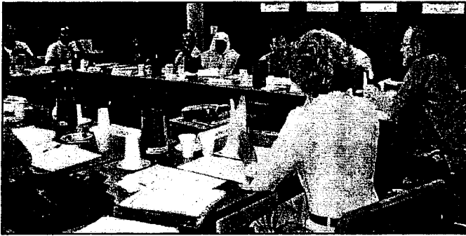
Seminar participants meet with regional experts at the EWC in Honolulu to discuss key regional issues prior to their group study tour.

For the 2009 program, participants will spend one week in Honolulu, Hawaii examining broad regional issues in areas such as politics, security, economics, energy, health and the environment, through discussions with one another, field visits and meetings with regional experts. This will be followed by one week of study tour travel to Seoul, Korea and Hanoi, Vietnam focusing on this year's program theme, "The Global Economic Crisis: Impacts and Responses in Asia." Participants will explore the how the current economic crisis is affecting countries in Asia, how countries are responding nationally, and what the Asia Pacific-U.S. region is doing together to address these unprecedented economic challenges.